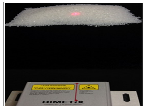
Pic 2: Dimetix Laser measures on white plastic pellets

Surfaces consisting of white plastic pellets are measured as accurately as those composed of dry or wet gravel. Even in the case of semitransparent plastic resin pellets, enough light is reflected back to the sensor to obtain accurate and reliable measurements.